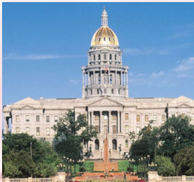
Colorado GOP - Taking back the State

Please urge your GOP CRC members to vote YES on the Great Colorado Opt-Out measure.